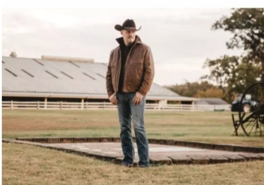
Adventures in Music